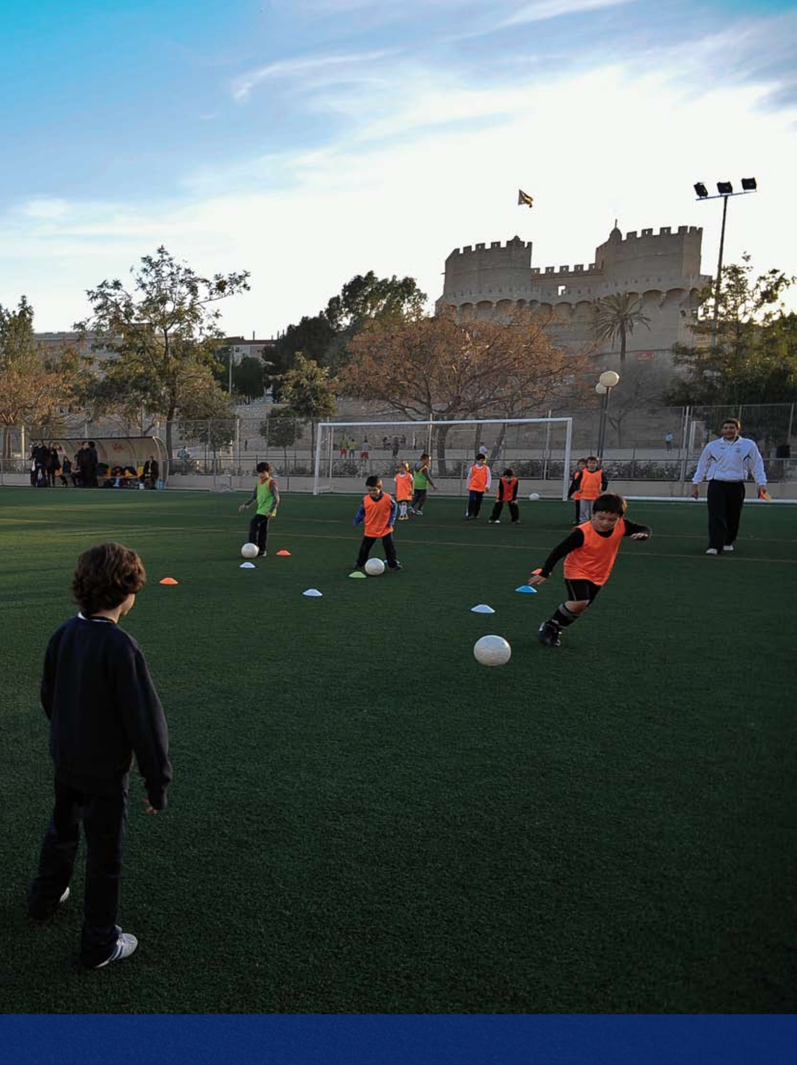
4. STRUCTURE AND METHODOLOGY